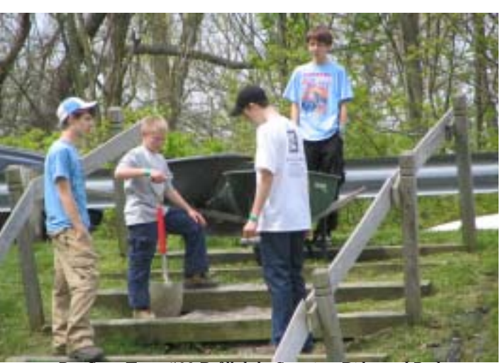
Boy Scout Troop 560 Refilled the Steps into Ridgewood Park