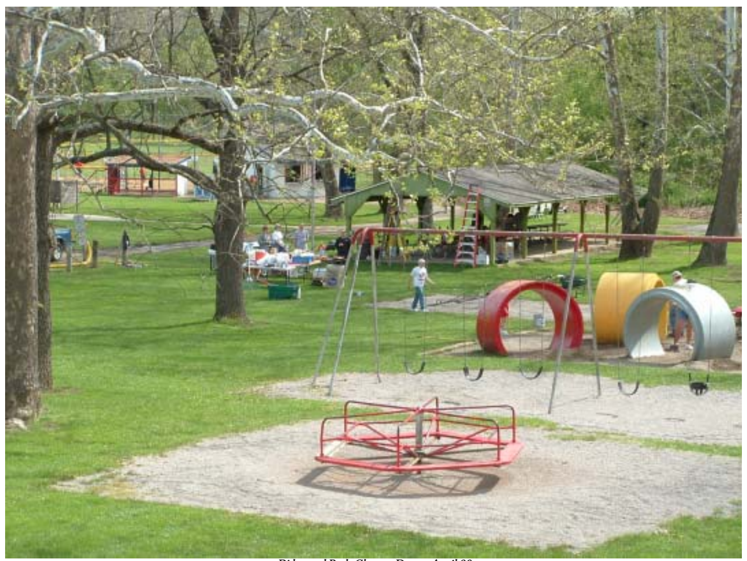
Ridgewood Park Cleanup Day on April 29