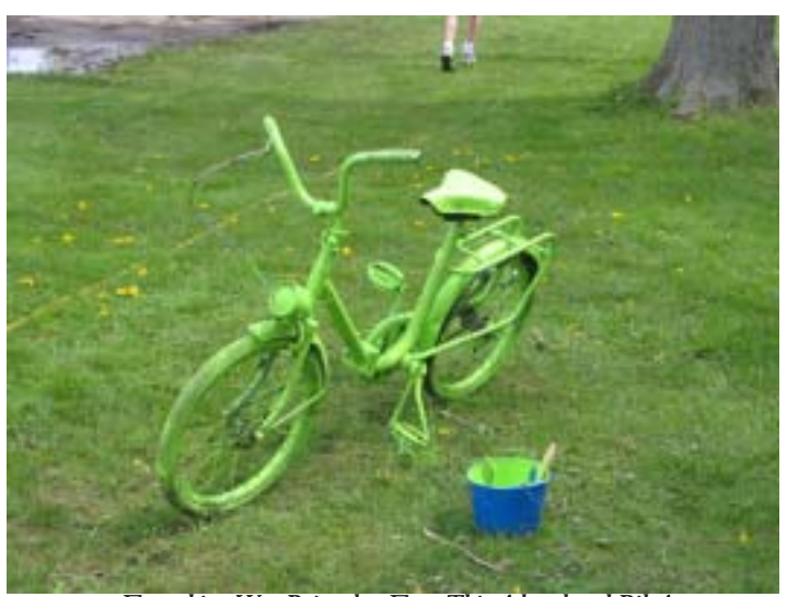
Everything Was Painted—Even This Abandoned Bike!