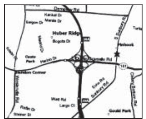
6025 South Sunbury Road Westerville, OH 43081