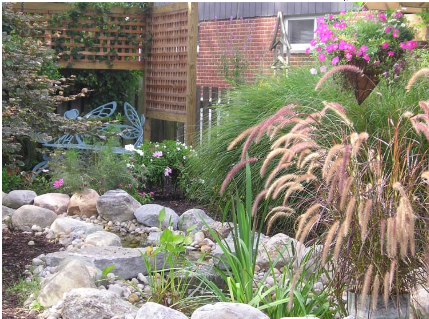
One of the Many Beautiful Backyards in Huber Ridge