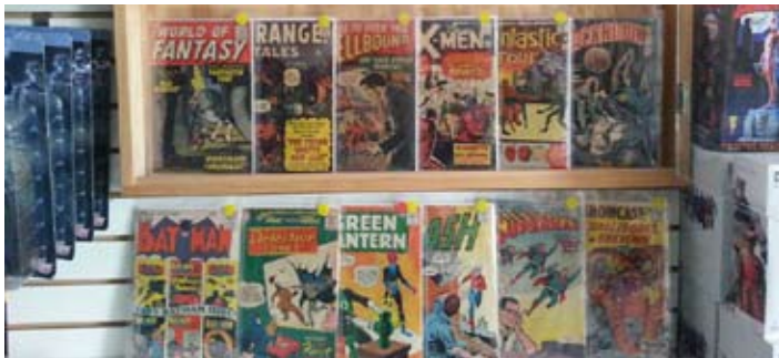
Some of the World's Greatest Comics