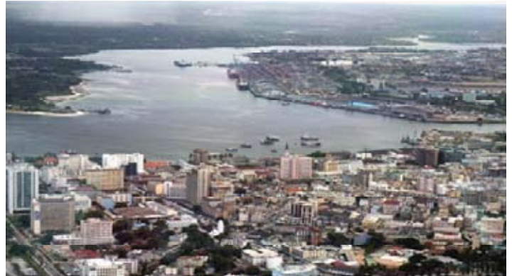
City of Dares Salaam in Tanzania

into each other! Note the picture of the city of Dares Salaam where Reuben landed! Yes, that's Africa!